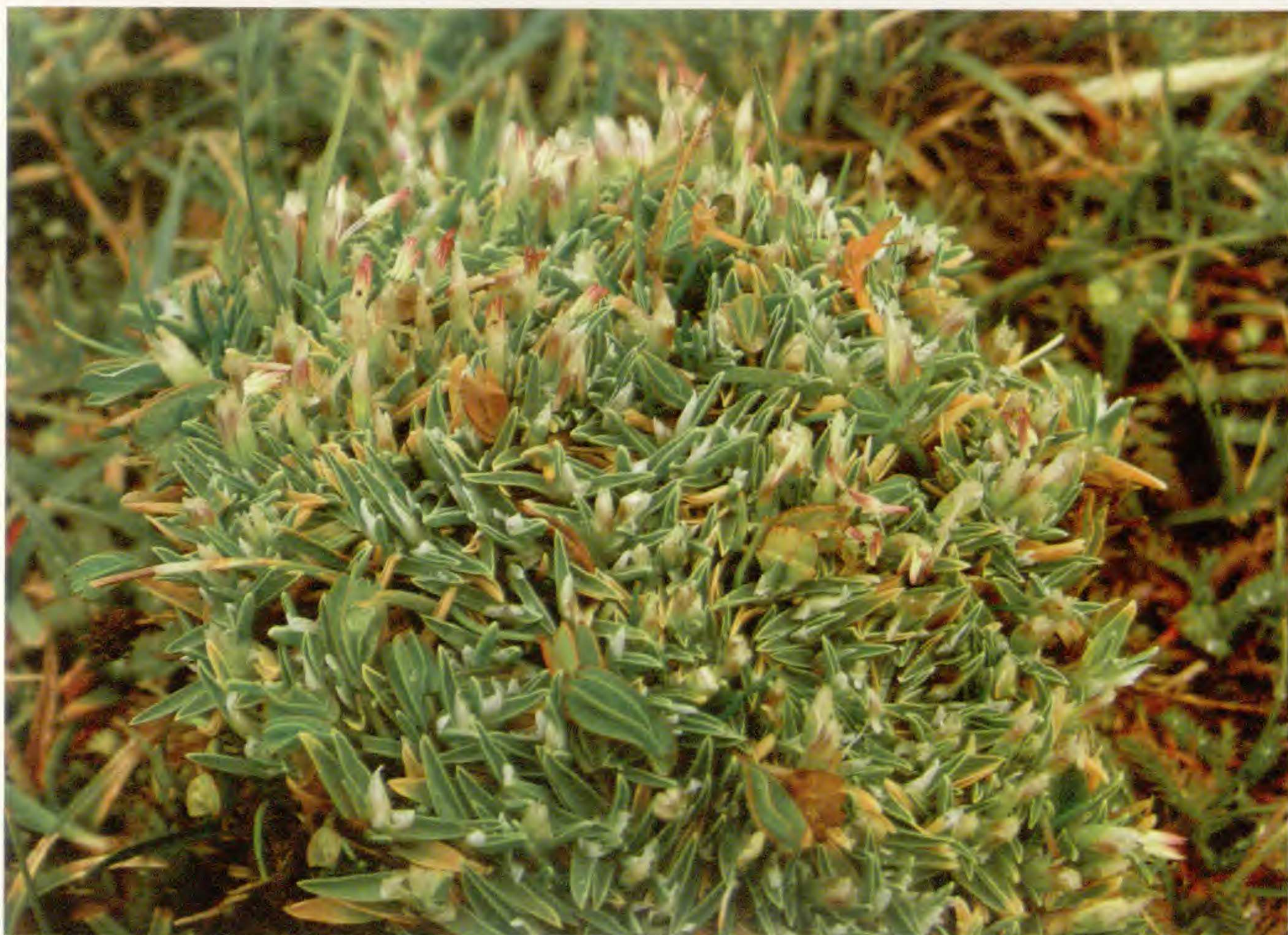
FIG. 2. Habit of Poa unispiculata [P.M. Peterson, R.J. Soreng & K. Romaschenko 20382 (US)]. A bisexual individual in anthesis, in vivo , excavated and laying on top of the surrounding thatch.